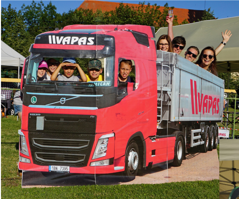
Self serviced photo booth - Sport day for employees - Vapas