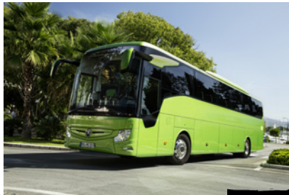
Photo booth for Family day Evobus / Mercedes